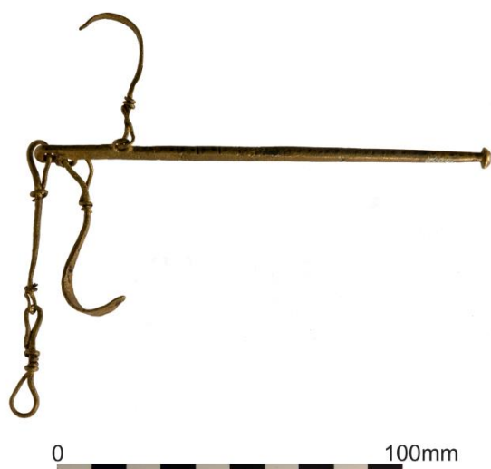
Fig 18. An example of the most common steelyard type from Britannia (MoL Inv.19068.3) (Table 6. BUC97*) (scale 1:2)

For example, one steelyard above from the MoL collection is given the typological code '2IIaa' (Fig 18). The arm has two (2) scales on opposite planes, the fulcrum loops are forged to the arm and project outward (II), the load loop is a forged loop with a single wire looped through (a) and the load instruments are figure eight wires wrapped around the shank and might have had a counterweight attached ( \alpha ). This type is the most common steelyard found in Britannia and the north-western provinces.